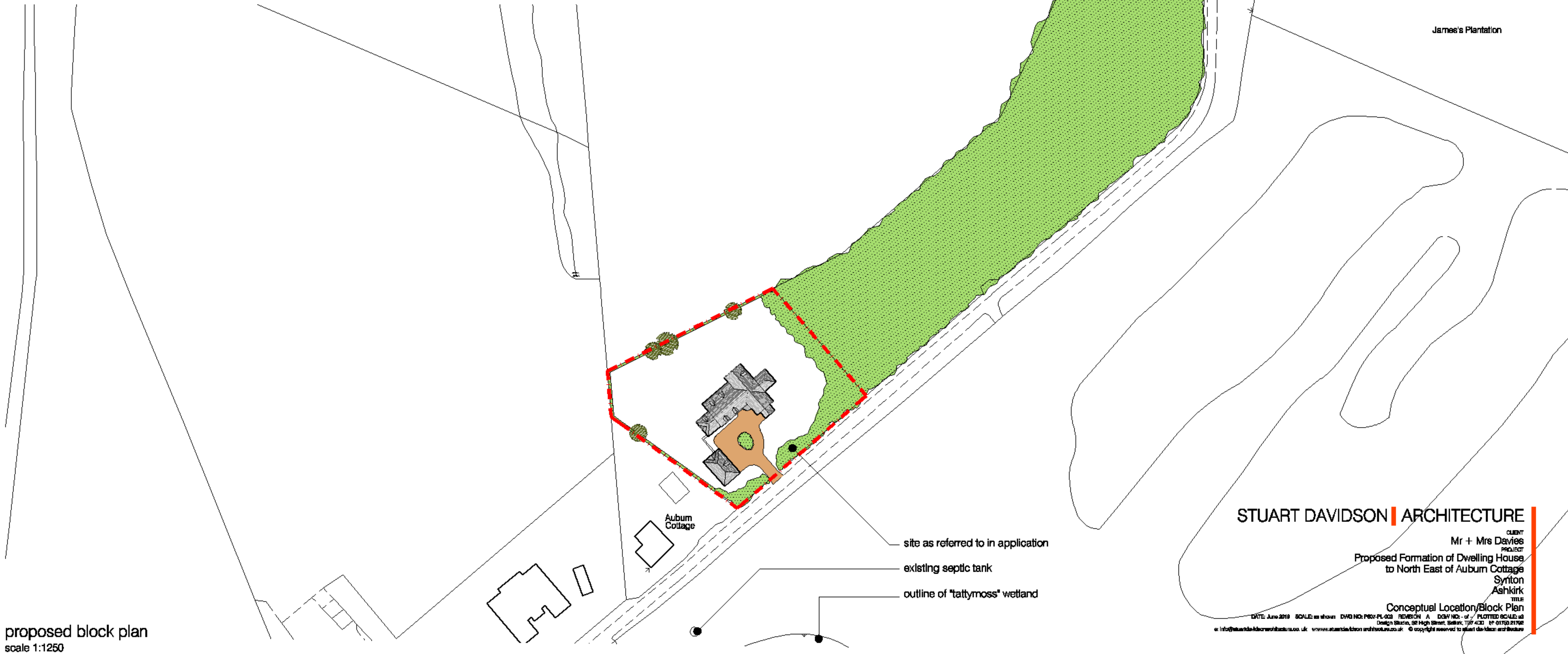
proposed block plan scale 1:1250